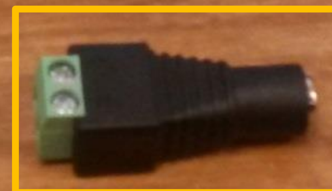
Female Barrel Jack 2.1mm x 5.5mm