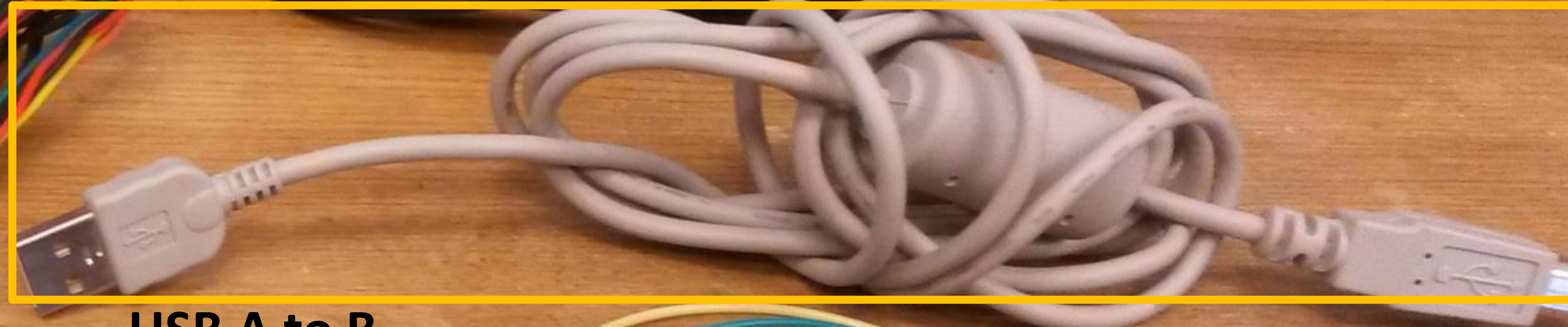
USB A to B Connector