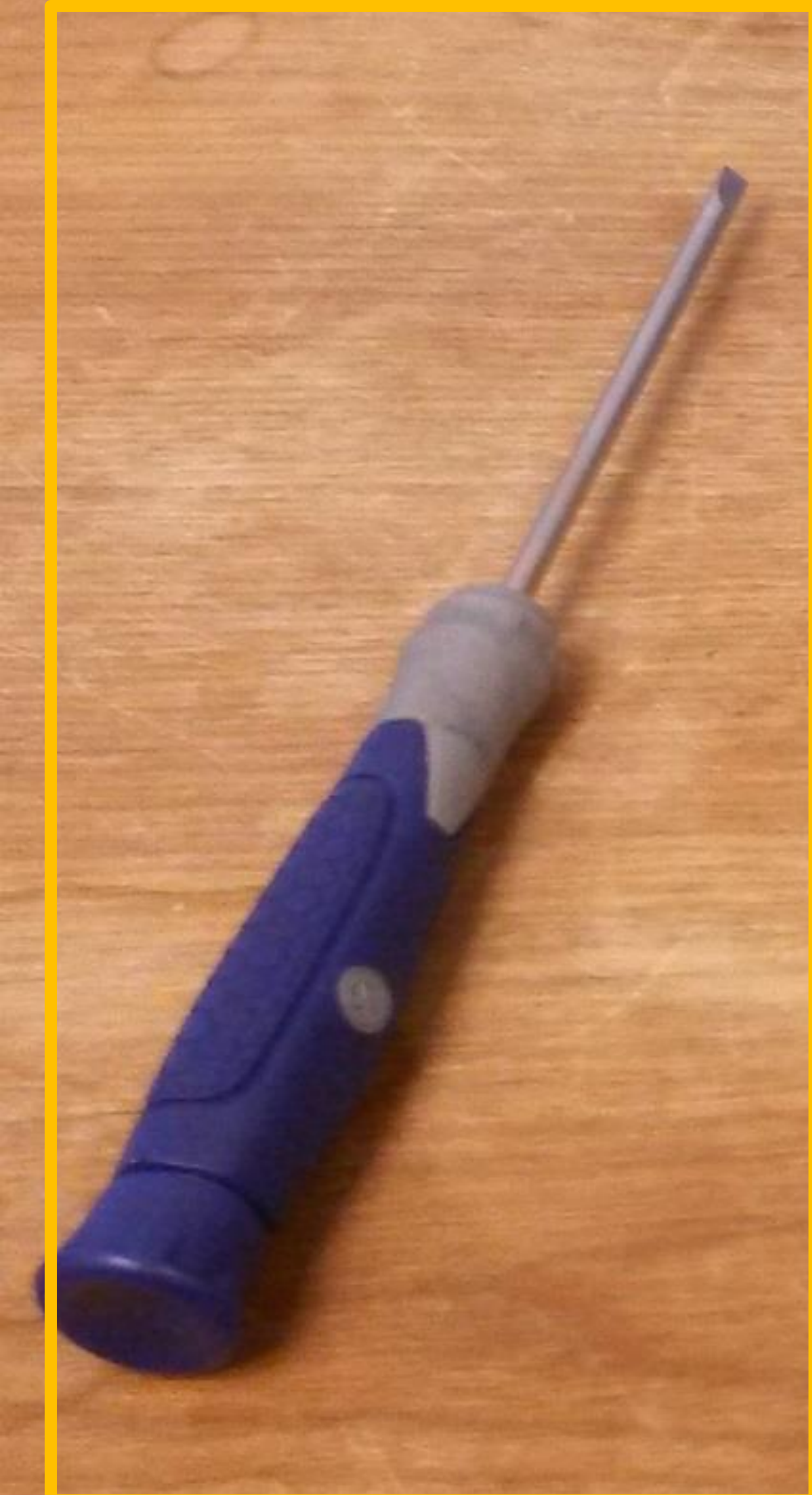
Small Flat-head Screw Driver