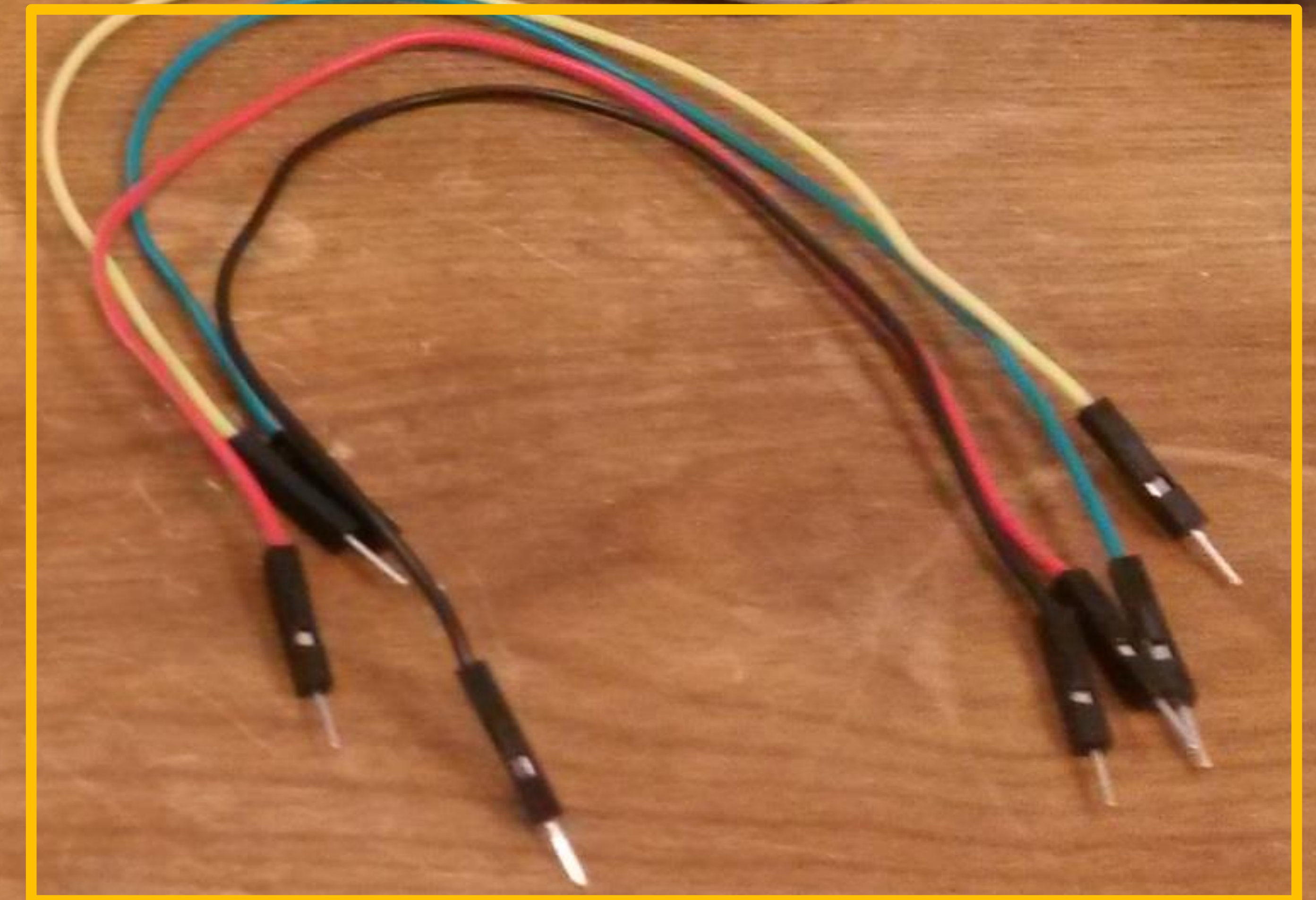
4 Male to Male Wires